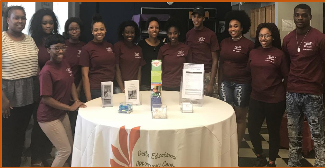
Mid-State Opportunity, Inc. Tallahatchie County