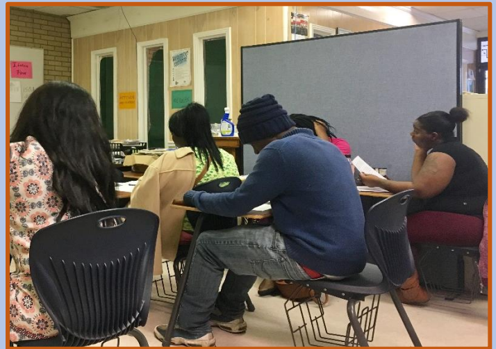
St. Gabriel Mercy Center Bolivar County Critical Thinking & Test Taking